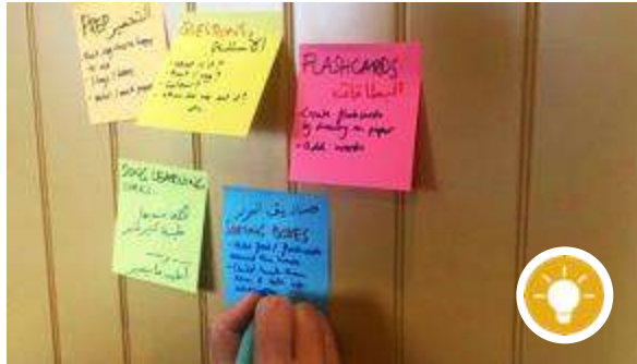
1 Curriculum plan