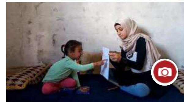
6 Feedback (& repeat)