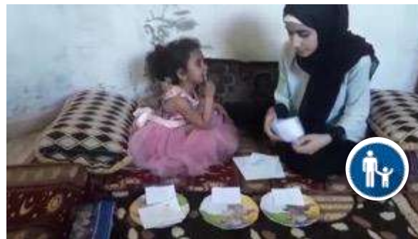
5 Caregiver delivery